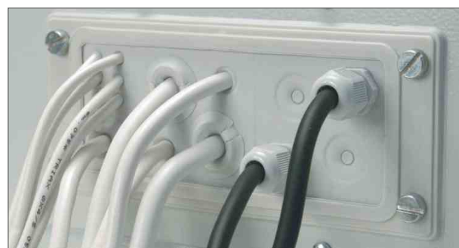
Frame Cat. No. & Dimensions